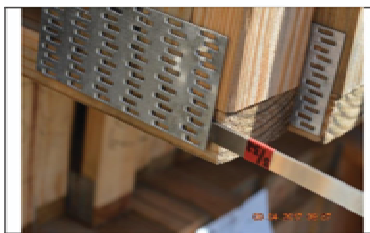
Photo no. 126 Truss on site ready for installation. Gap between truss plate... (No capacity beyond 3/32" gap).